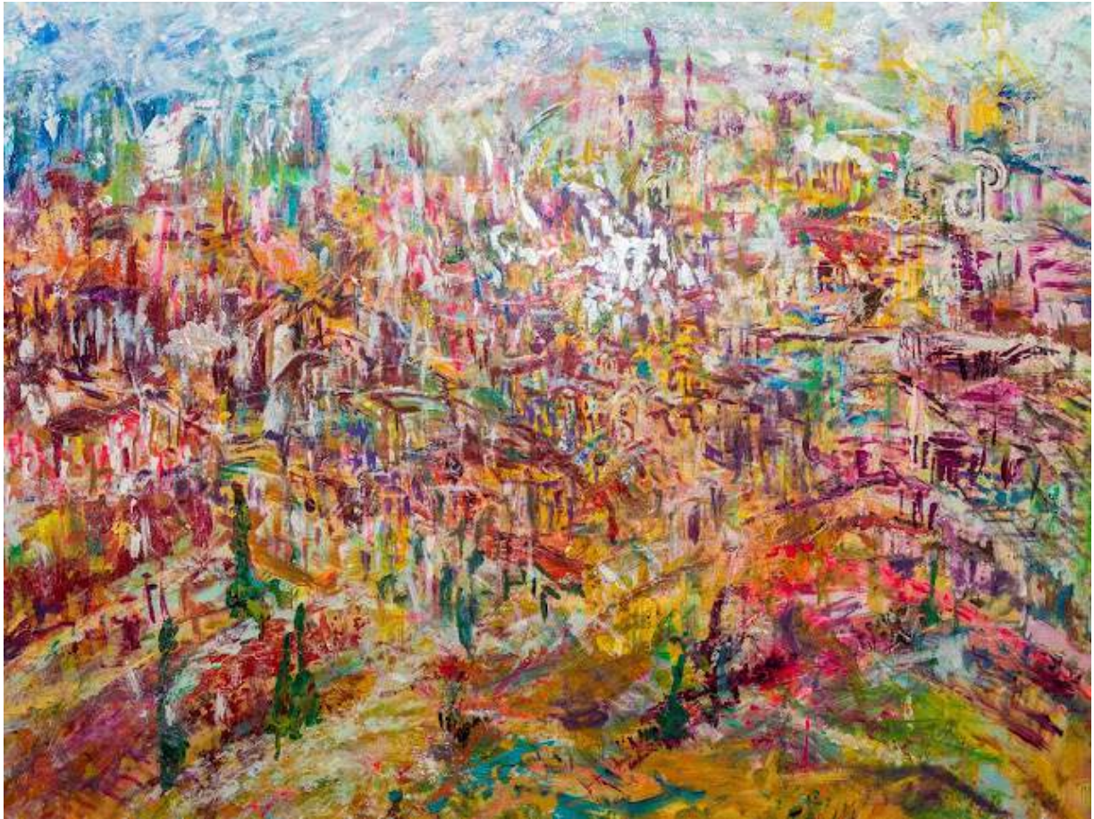
META Resemblance | Acrylic, Gouache, Oil, Watercolor | 36 x 40 in.

In some ways, I'm like a tree. Studying the curves in this road. Watching the sky open. Feeling whispers in the air.