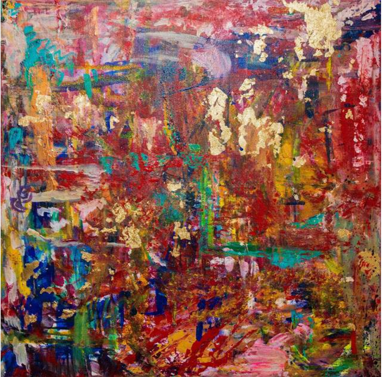
ECSTASY Resemblance | Acrylic, Gouache, Oil, Gold Leaf | 36 x 36 in.

Let go. Follow me in. My heart tells me you are the purest sin.